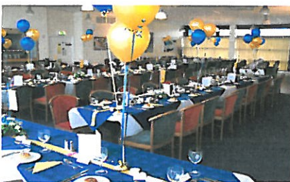
Board Room 10 to 20 people